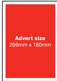
Full page advert H 266mm x W 180mm