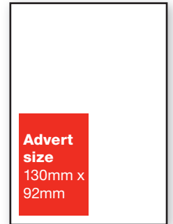
¼ page advert H 130mm x W 92mm