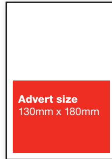
½ page advert H 130mm x W 180mm