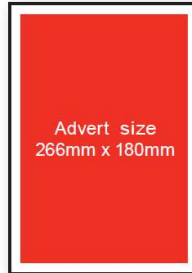
Full page advert H 266mm x W 180mm