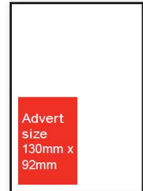
¼ page advert H 130mm x W 92mm