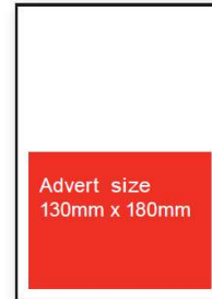
½ page advert H 130mm x W 180mm